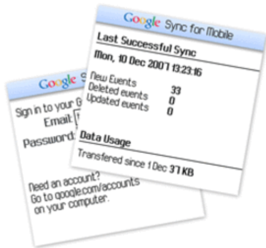
Figure 7 (Google Mobile)

Congratulations! The calendar is now successfully backed up on the Google website! This simple process will save hours of stress in the event that information needs to be recovered due to a data loss.