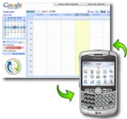
Figure 5 (Google Mobile)