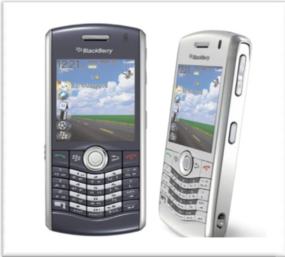
Figure 1 (Blackberry)