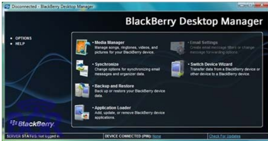
Figure 3 (Blackberry)