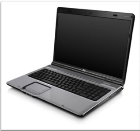
Figure 2 (Hewlett Packard)